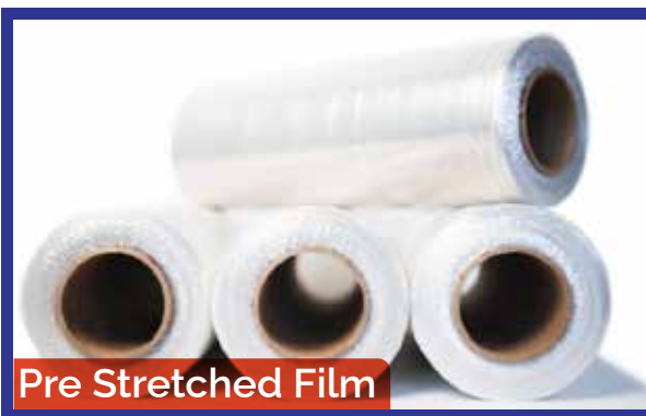
Pre Stretched Film