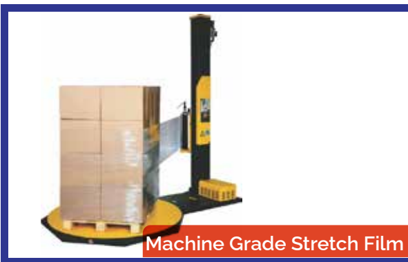
Machine Grade Stretch Film