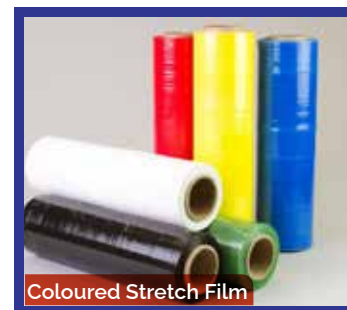
Coloured Stretch Film