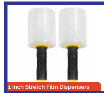
1 Inch Stretch Film Dispensers