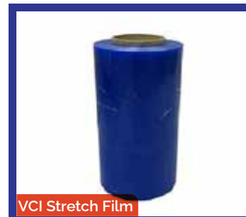
VCI Stretch Film