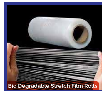
Bio Degradable Stretch Film Rolls