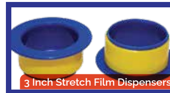
3 Inch Stretch Film Dispensers