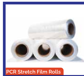
PCR Stretch Film Rolls