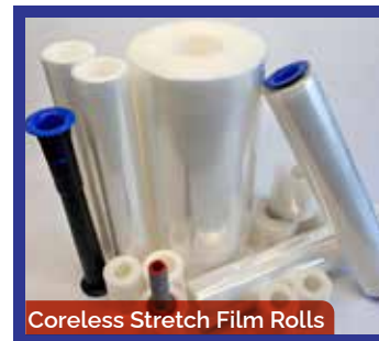
Coreless Stretch Film Rolls