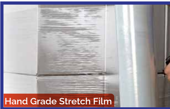
Hand Grade Stretch Film