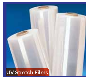
UV Stretch Films